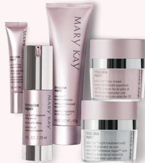
ADVANCED SIGNS OF AGING SOLUTIONS