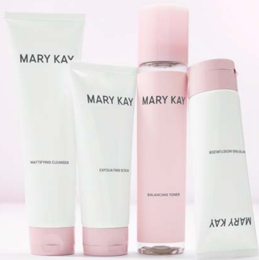
SIMPLE SKIN CARE SOLUTIONS