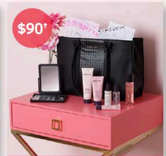
MARY KAY® PRO START*

*Prices are as shown plus applicable sales tax. Mary Kay® eStart offer cannot be combined with any other discounts or promotions. Mary Kay Inc. reserves the right to extend, modify, eliminate or reduce this offer at any time